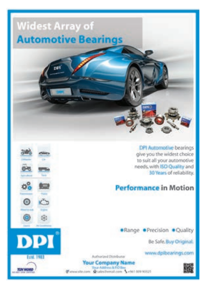
DPI Automotive Flyer