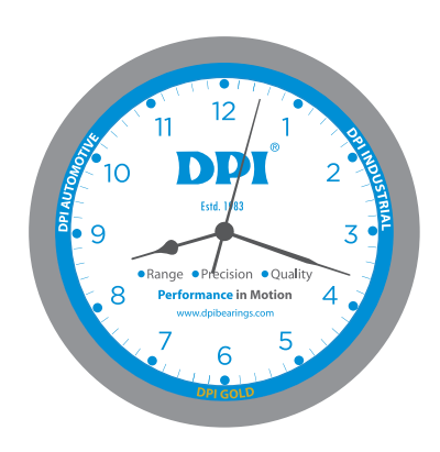
DPI Wall Clock