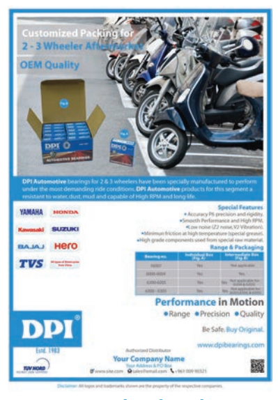
DPI 2-3 Wheeler Flyer