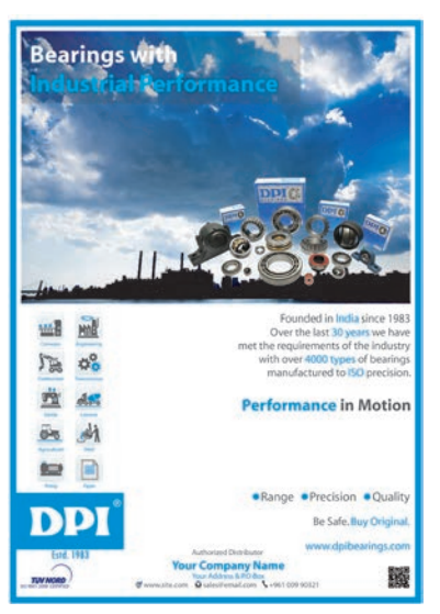
DPI Industrial Flyer